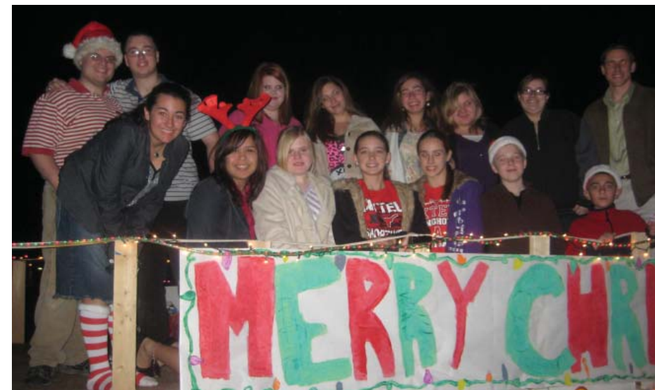
Bellmead Calvary Baptist Church Youth