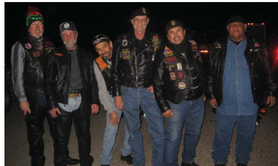
American Legion Riders Post 121