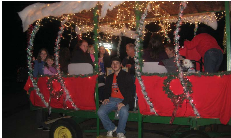
Roger's Barber Shop