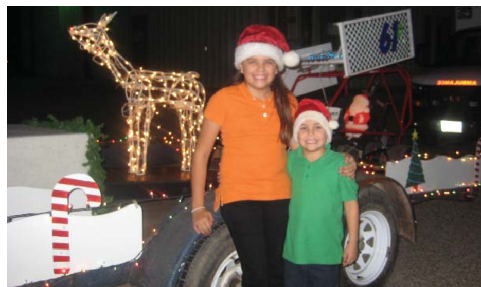
DeRoon Motor Sports