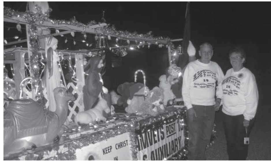
AmVets Post 19