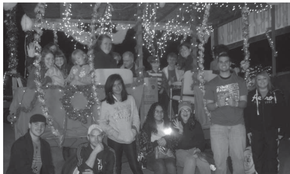
Timber Crest Baptist Church