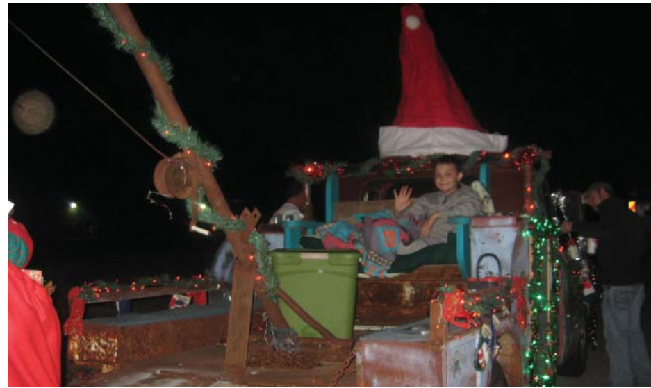
Cohrt Family Float