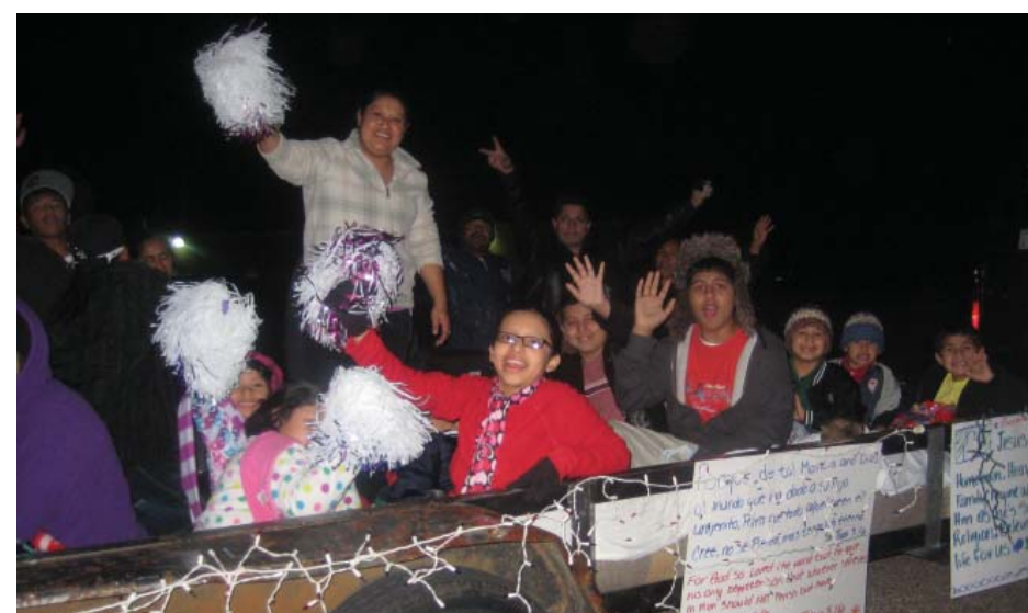
Centro Christian Ryo De Luz