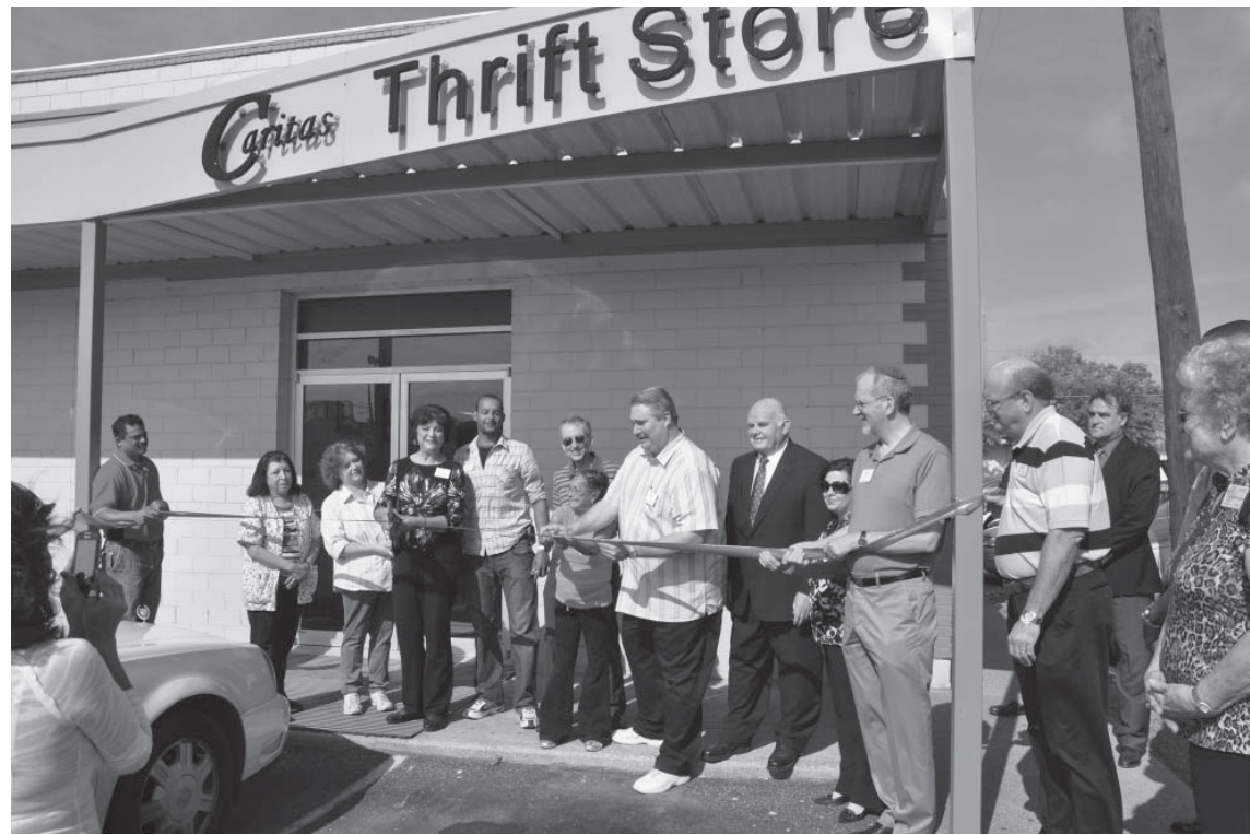
The Bellmead Chamber of Commerce helped Caritas celebrate its new thrift store at 3016 Bellmead Drive. The store is open from 9 a.m. to 5 p.m. Monday through Saturday. The store accepts donations and sells a variety of clothing and household items. For more information, call (254) 799-0777.

In 2004, Caritas became the distribution center for gifts-in-kind products to local and state-wide charities through the Wal-Mart Return Center in Waco. Caritas receives warehouse items, then distributes hundreds of thousands of pounds of much needed paper and household items to charitable organizations and food banks serving people in need. Agencies receiving these products are asked to defray Caritas' costs through