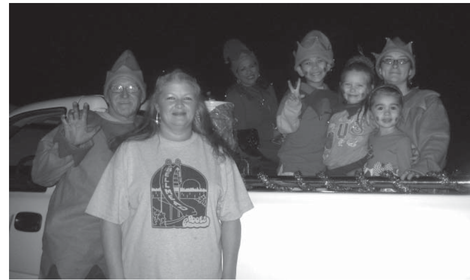
Bellmead Pools & Supply